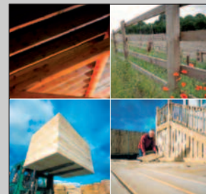
Irish sawmills continue to increase export market share in construction, fencing, packaging and leisure products despite difficult trading conditions

The seminar is part of the Wood Marketing Federation wood promotional programme supported by COFORD, Department of Agriculture, Food & Marine. Venue by kind permission of the OPW