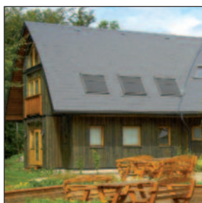
Coillte HQ, Co. Wicklow Stewart + Sinnott Studio Architects