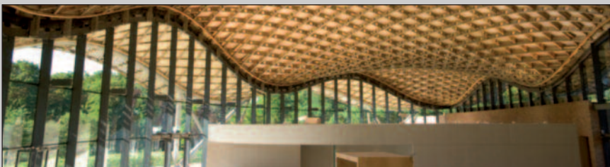
Savill Garden Visitor Centre, Windsor (cover and below) with larch gridshell roof, clad with green oak Glen Howells Architects