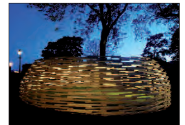
Left: Woodspace - Forest of Light at Electric Picnic 2012 in Strabally.